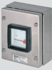
Type 414 81..