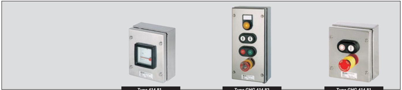
Type 414 81..